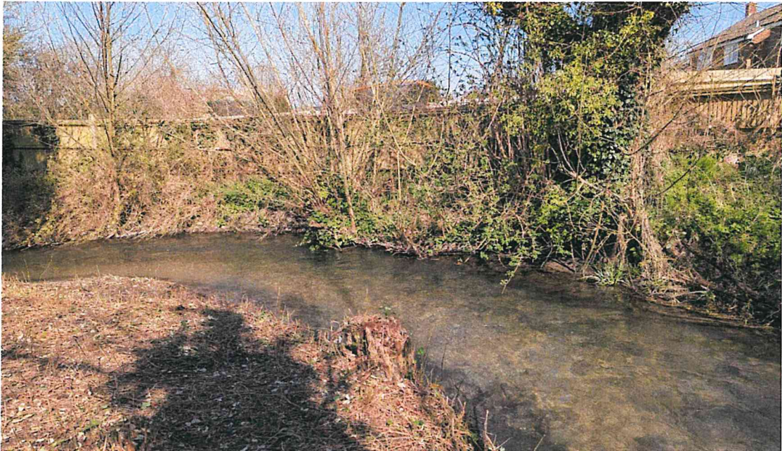
Clear view of the brook afterwards, with sunlight beaming into the water and edges.

The bramble clearance at Willow Walk has made the entrance to the reserve more open and welcoming, encouraging people to visit the Letcombe Brook. We've also created more space for a wildflower meadow, and plan to introduce plug plants to this area in the autumn.