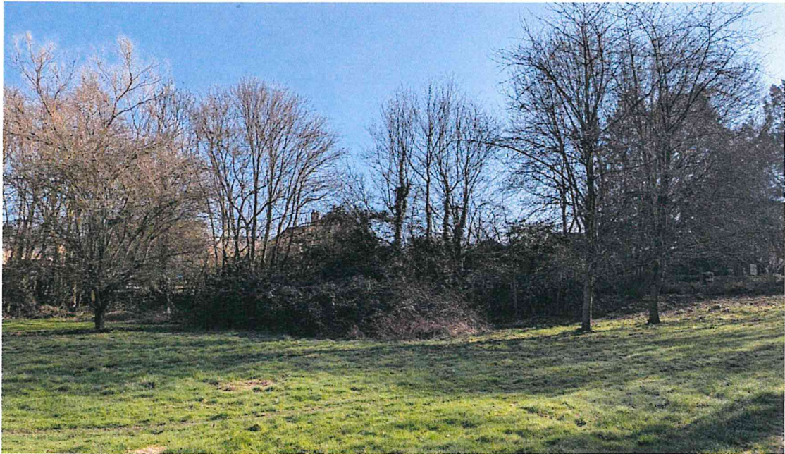
Huge bramble patch at Willow Walk making the entrance dark and gloomy, before work started.