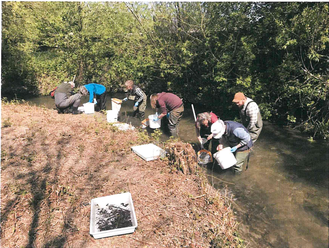
Above: New riverfly monitors getting stuck in at Letcombe Brook, Grove

We were delighted to train twelve new volunteer riverfly surveyors in April, who will carry out monthly checks on invertebrate populations at key sites along the brook. This data provides invaluable information on the health of the Letcombe Brook and means we are much more likely to detect any incidents of pollution. We are very grateful to TOE (Trust for Oxfordshire's Environment) for a grant from the TVERC Recorders' Grant Scheme which enabled us to purchase the equipment needed for this monitoring programme.