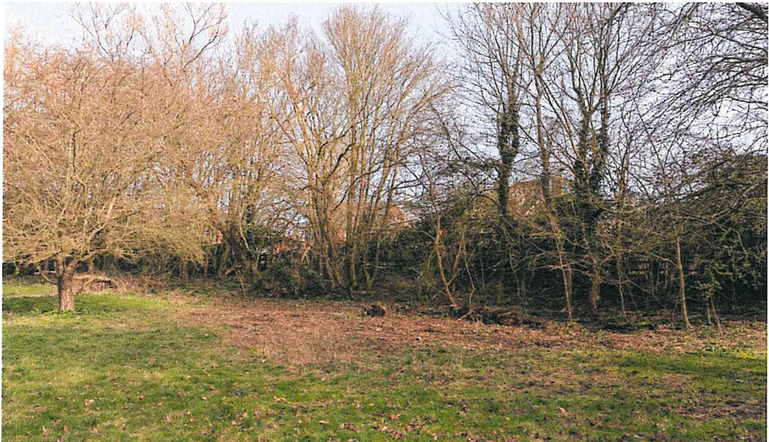
At the end of the work party at Willow Walk Nature Reserve